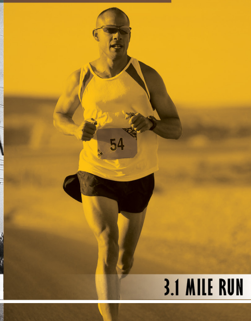
3.1 MILE RUN

Register at the Drill Hall by June 3. 47382 Keane Rd Bldg. 458 Patuxent River, MD 20670 301-757-3943