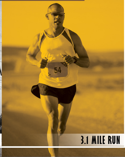
3.1 MILE RUN

Register at the Drill Hall by June 9. 47382 Keane Rd Bldg. 458 Patuxent River, MD 20670 301-757-3943