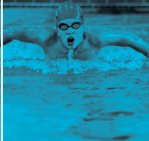
0.5 MILE SWIM